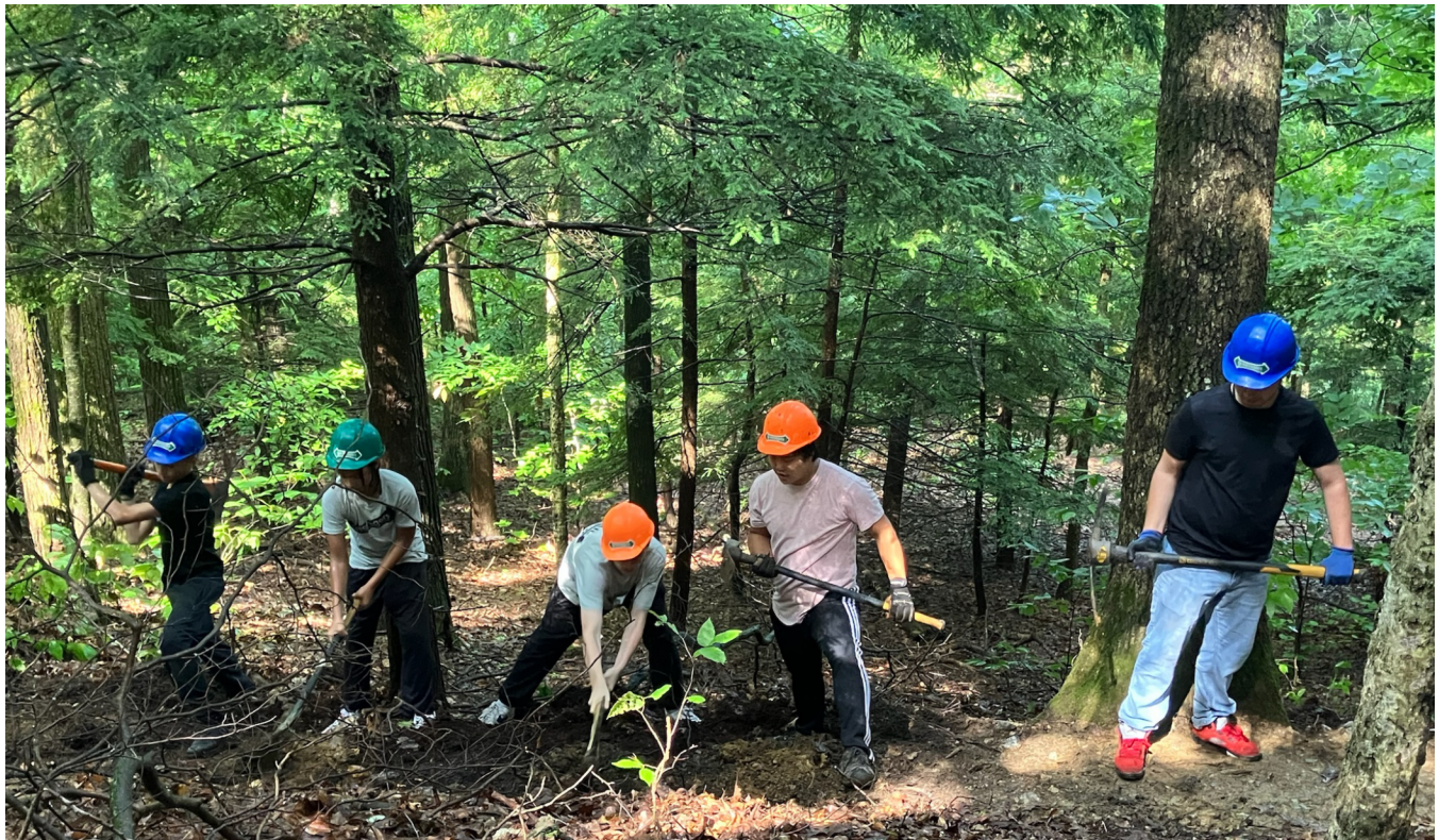
TRAIL CREW MAKING A BENCHCUT.