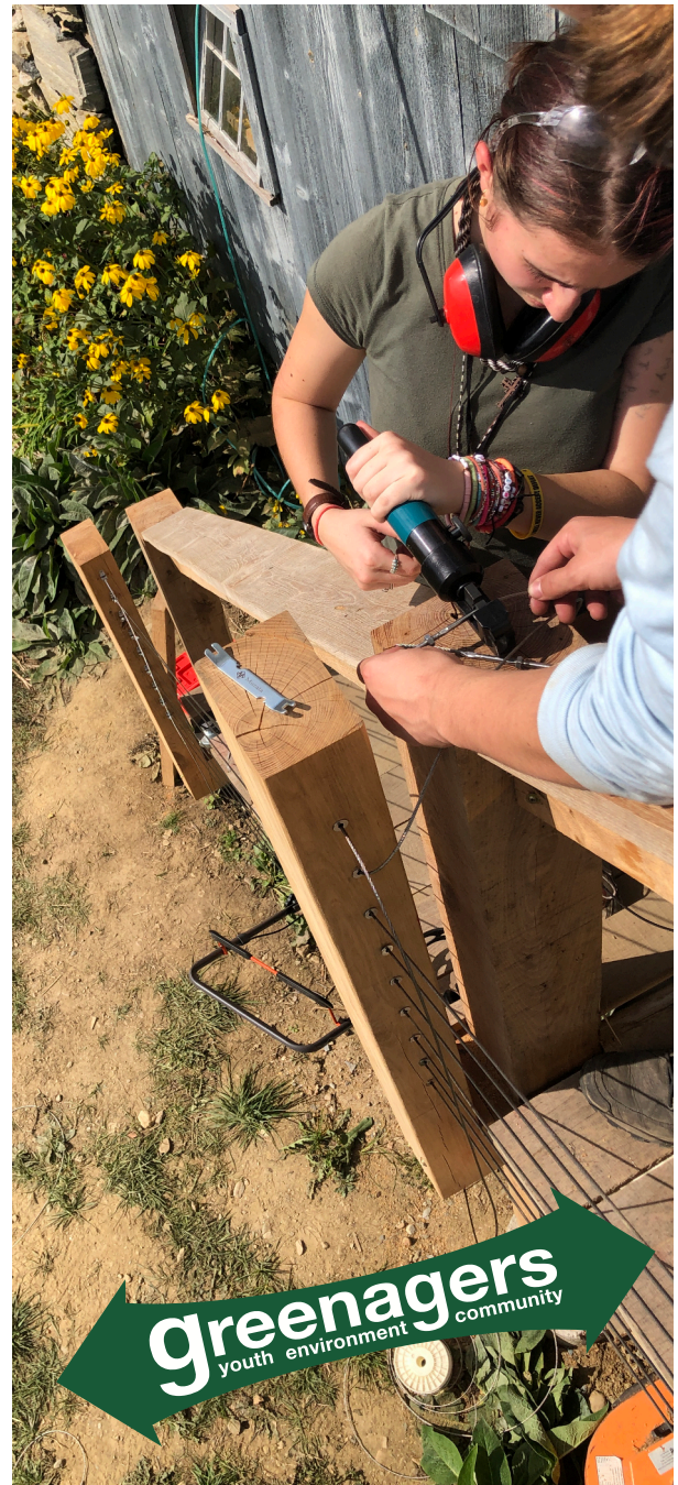
TRADES CREW BUILDING A NEW STAIRCASE ON THE BARN.