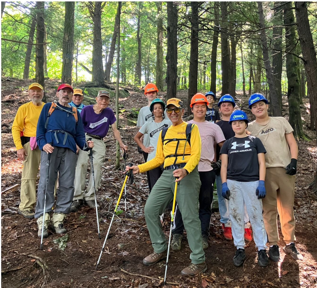
THE MONDAY MOUNTAIN BOYS AND PITTSFIELD TRAIL CREW