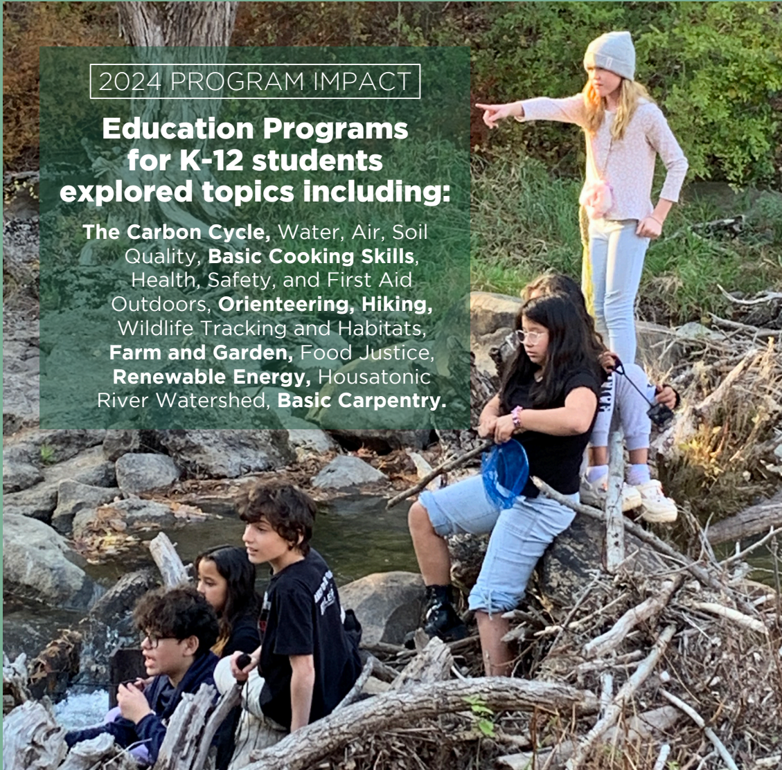
EDUCATION PROGRAM PARTICIPANTS

The Carbon Cycle, Water, Air, Soil Quality, Basic Cooking Skills, Health, Safety, and First Aid Outdoors, Orienteering, Hiking, Wildlife Tracking and Habitats, Farm and Garden, Food Justice, Renewable Energy, Housatonic River Watershed, Basic Carpentry.