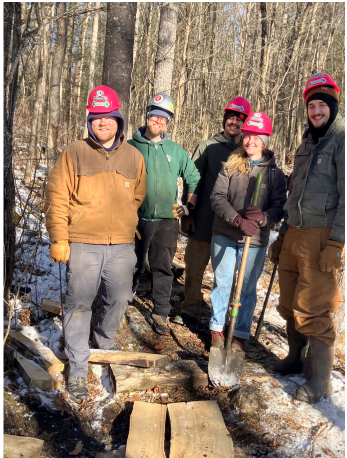
THE AMERICORPS TEAM