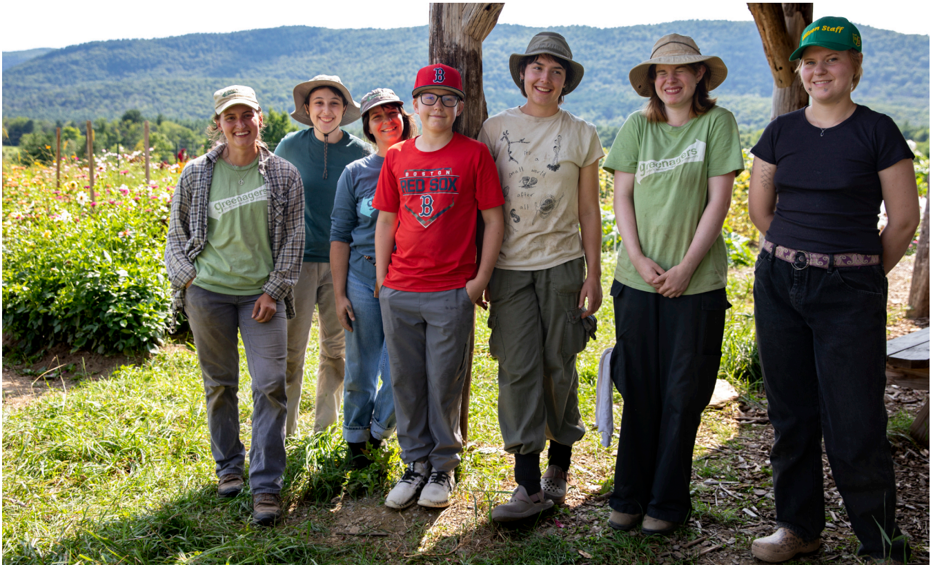
THE FARM CREW