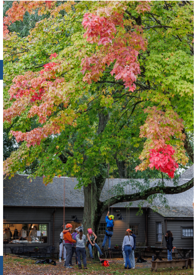
AT THE WOMEN IN CONSERVATION, AGRICULTURE, AND TRADES CONFERENCE