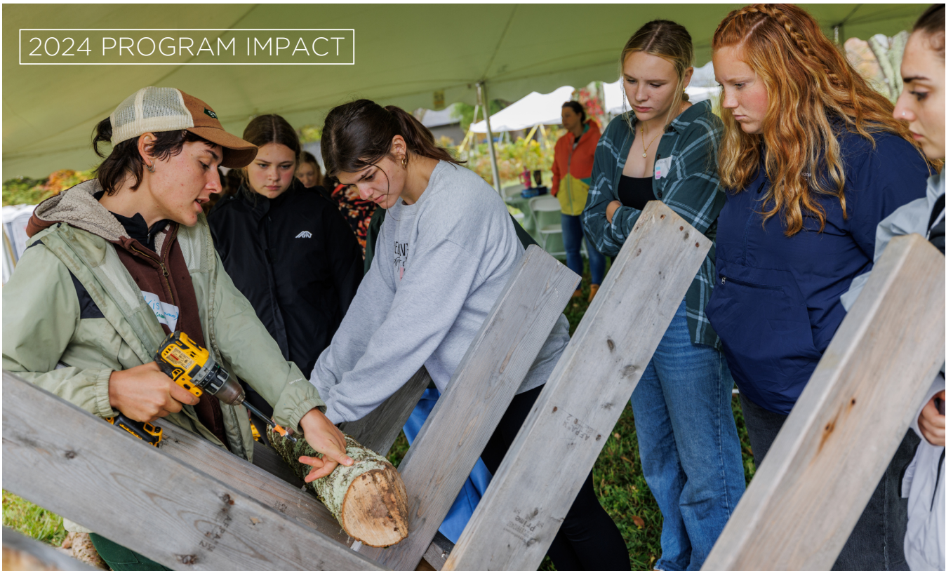
2024 PROGRAM IMPACT

70 students attended the 3rd annual Women in Conservation, Agriculture and Trades (WICAT) conference.