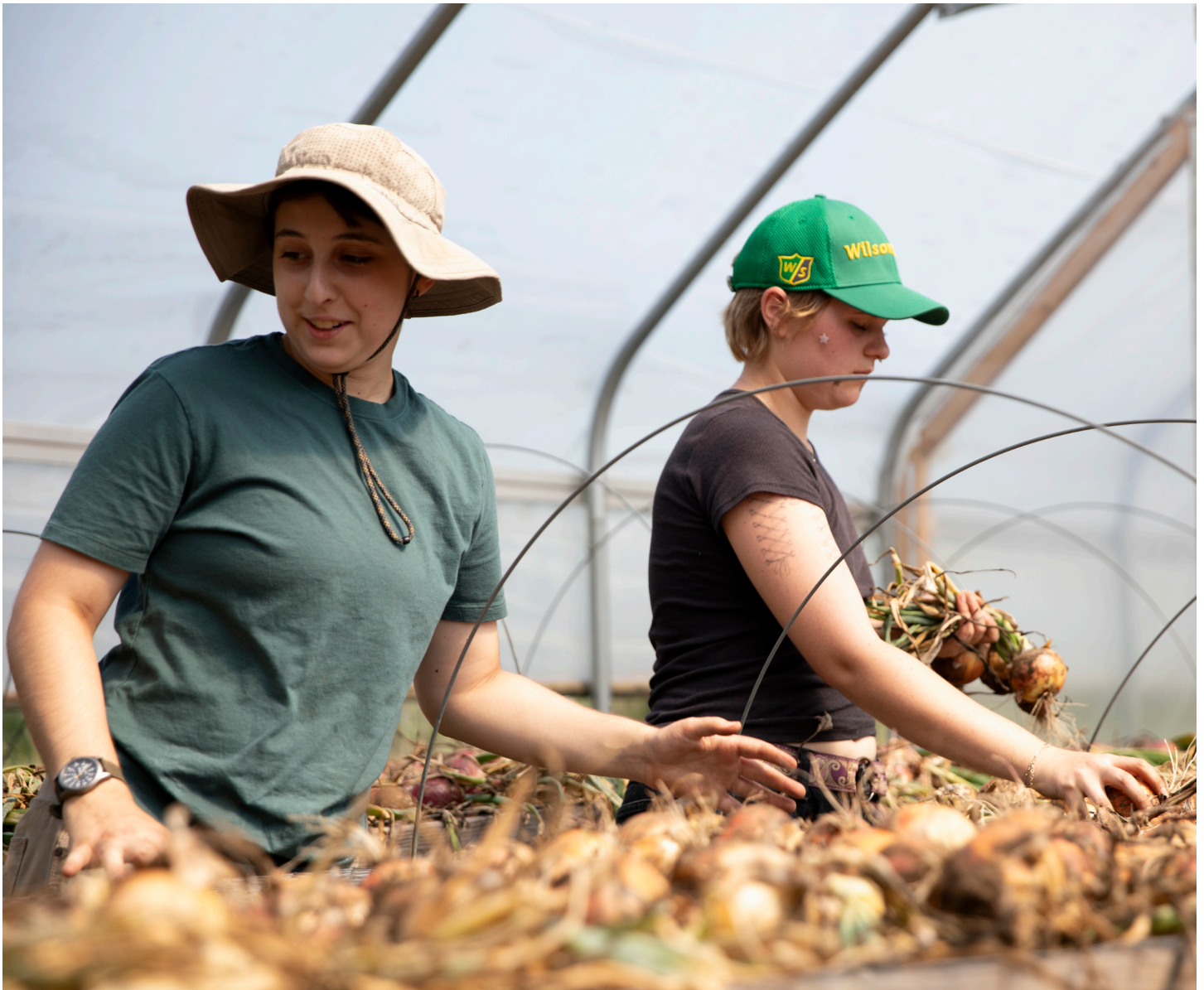
Preparing onions for storage.

April Hill Farm collaborates with High Spirit Community Farm (HSCF) to transport the food grown by our youth Farm Crew in South Egremont to Mercado de Vida , a food access site in Pittsfield. Each Thursday, members of HSCF pick up boxes of produce from our cooler, add it to their own farm goods and generously drive it north to be distributed by Mercado de Vida.