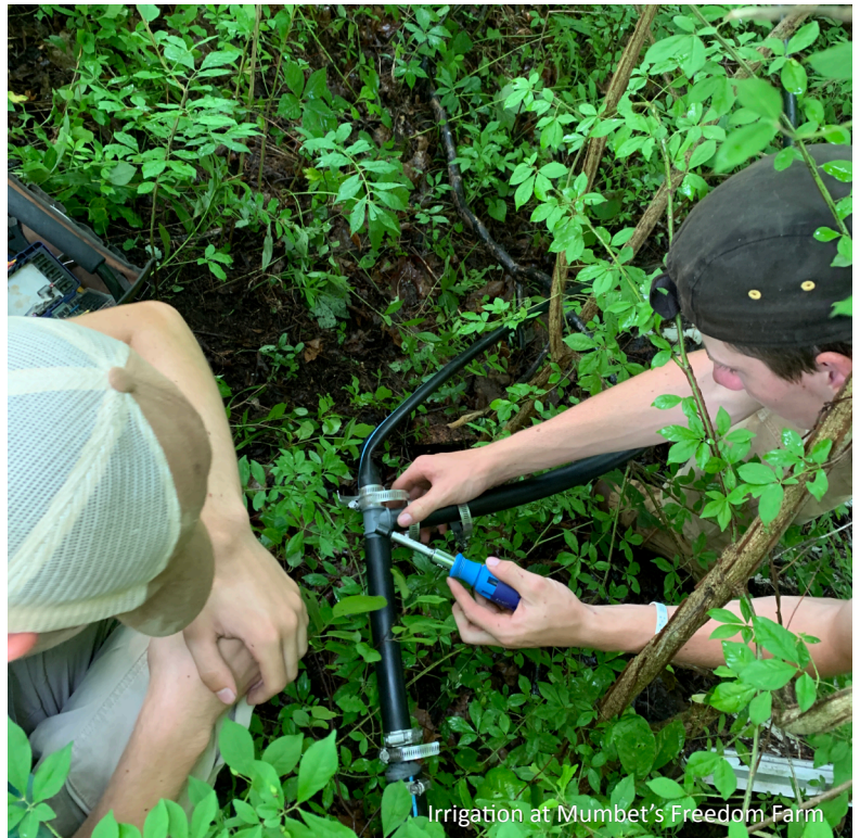
Irrigation at Mumbet's Freedom Farm