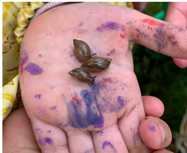
South Egremont students.