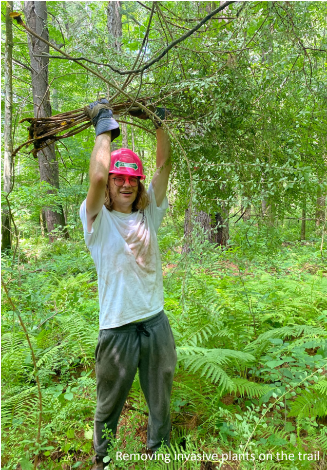
Removing invasive plants on the trail