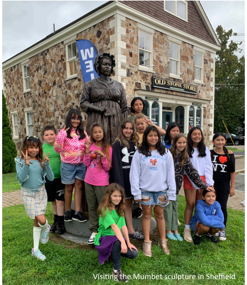
Visiting the Mumbet sculpture in Sheffield