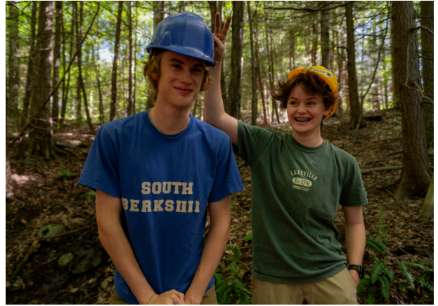
THE TRAIL CREW AT WORK IN THE WOODS IN SUMMER 2023