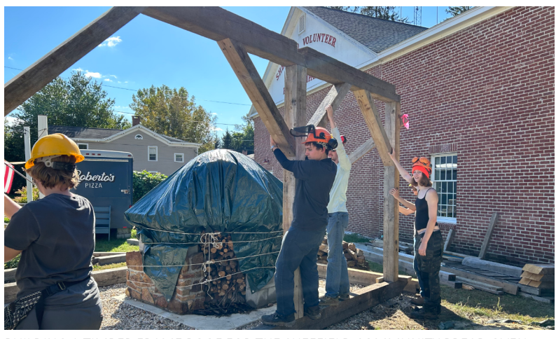
BUILDING A TIMBER FRAME ROOF FOR THE SHEFFIELD COMMUNITY BREAD OVEN