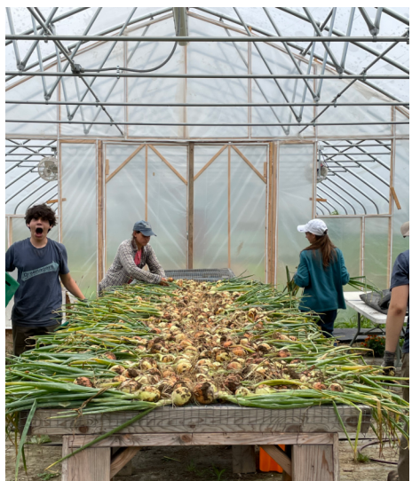
FRESH STRAWBERRIES WASHING POTATOES OUR ONION HARVEST