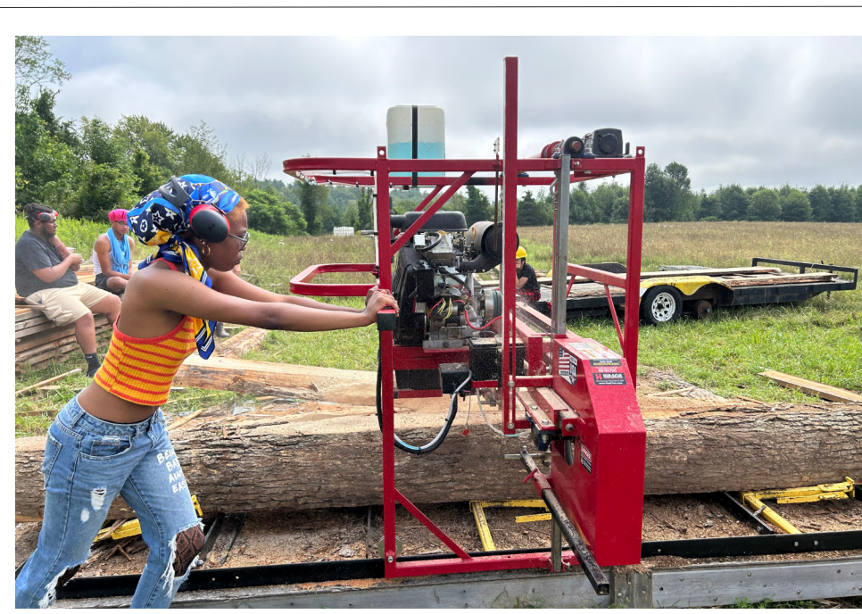
A ROCKING THE BOAT PARTICIPANT MILLING LUMBER AT APRIL HILL

"I learned how to respect nature, as well as how to motivate others through difficult times."