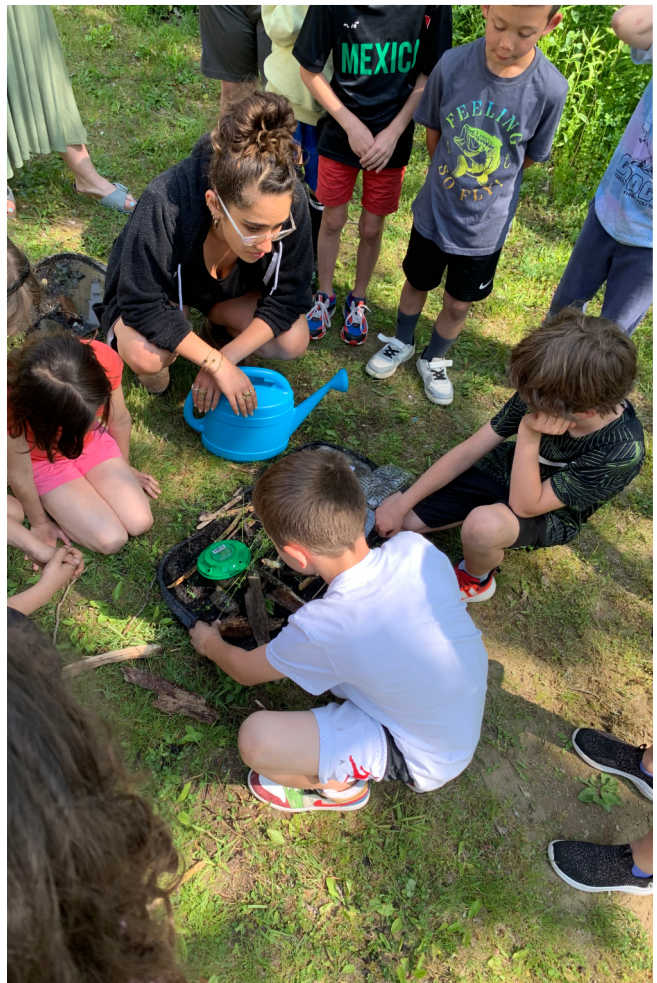
PEPPA WORKING WITH A SCHOOL GROUP