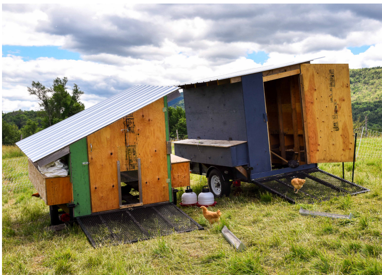
MOBILE CHICKEN COOPS BUILT BY OUR PATHWAYS TO THE TRADES STUDENTS