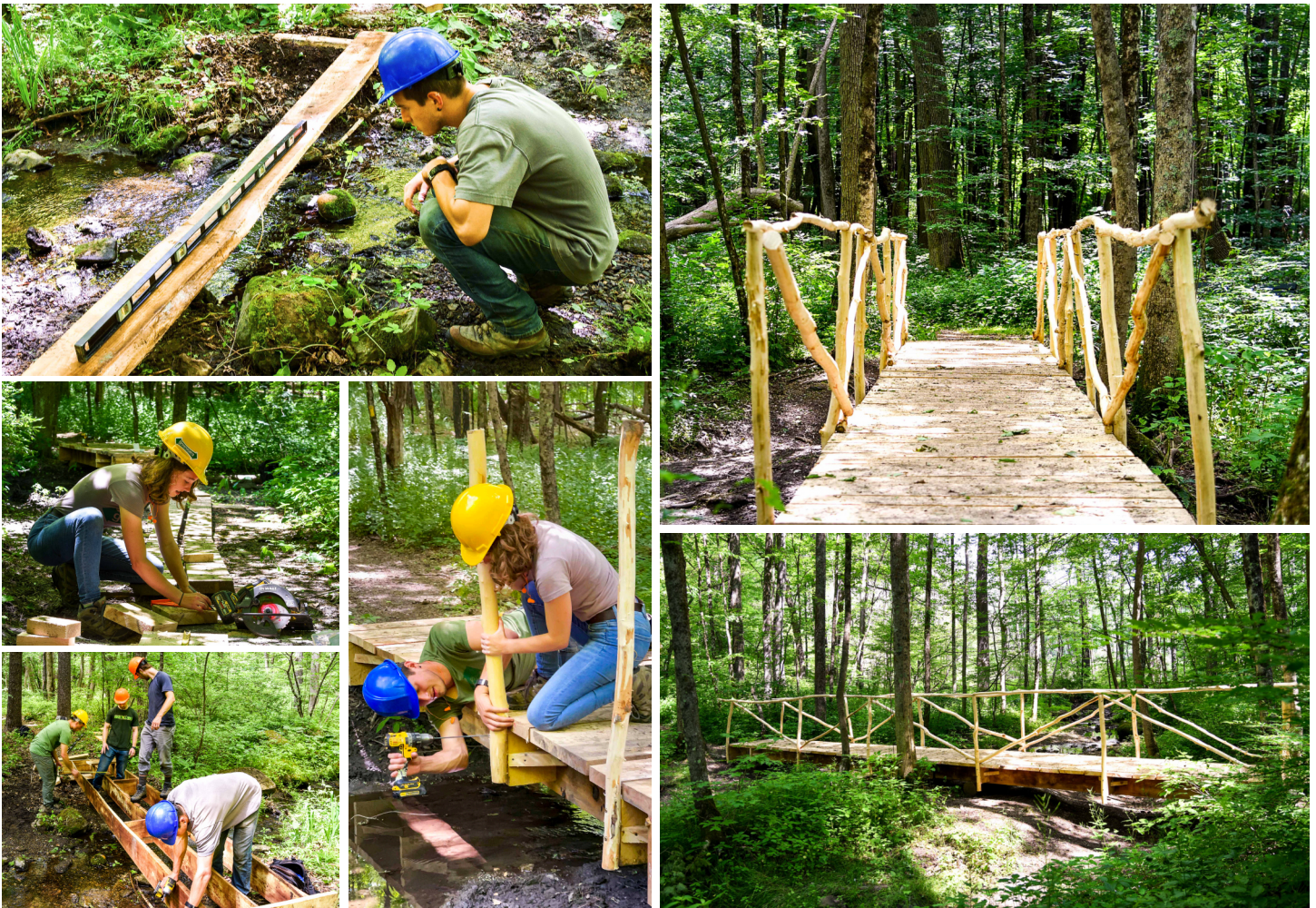
REPLACING A BRIDGE AT FRENCH PARK IN EGREMONT